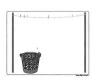
2.8 Clothes Line

Equipment: A washing line made of string tied between two chairs, clothes pegs and some doll's clothes OR the picture of a washing line and pictures of clothes on the CD.