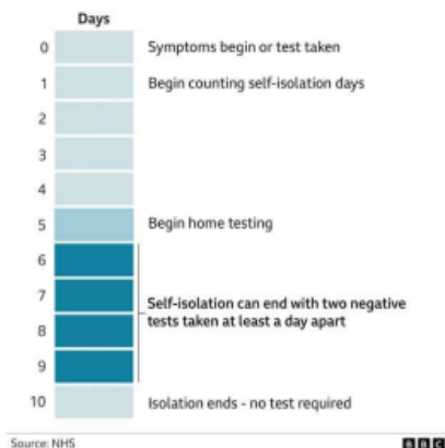
How five-day isolation rule works in England

https://www.gov.uk/report-covid19-result hpcovid19@holgateprimary.org